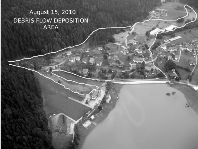
Fig. 1 Deposition area of the August 15, 2010 debris flow event in the Val Molinara